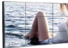
LCD Video Wall