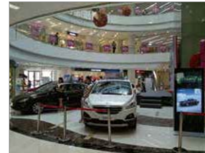
Peugeot 4S store