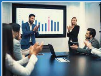
CONFERENCE ROOM / CLASSROOM