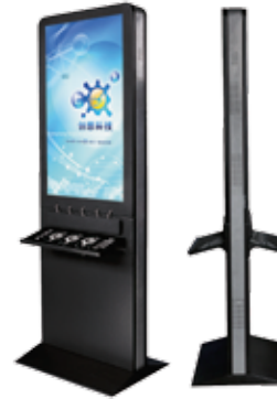
Customized Floor Stand DS