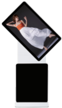
Rotated Floor Stand DS