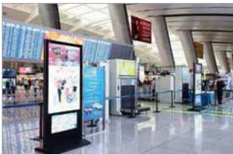
High-speed rail station