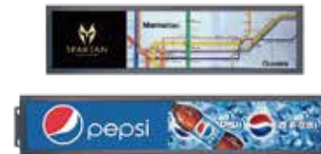
Bar Stretched Screen