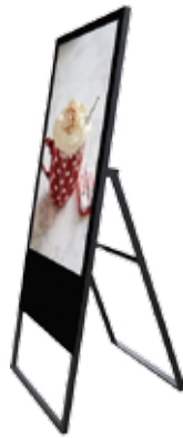
Portable Digital Signage