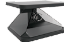
3D Hologram Display