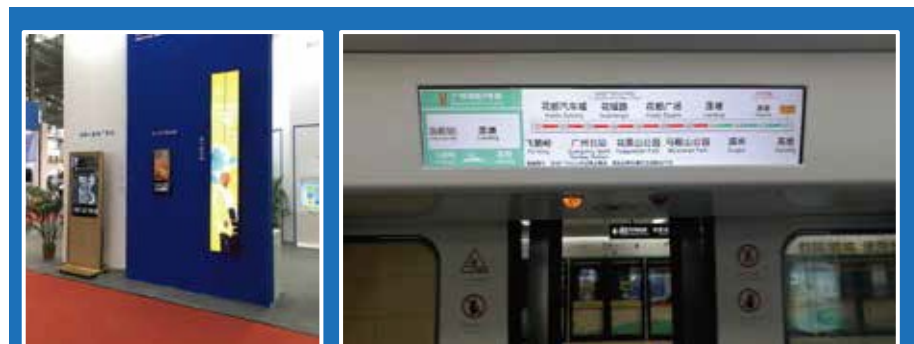
TRAIN / EXPRESSWAY