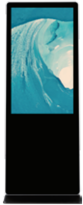
Floor Stand Advertising Display