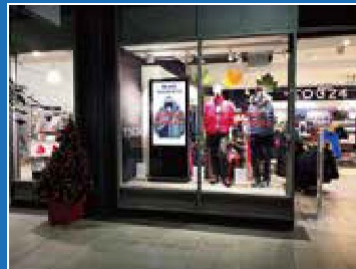
LARGE STORES / OFFICE / SHOP DOORWAY