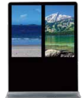
Double Screen Outdoor DS