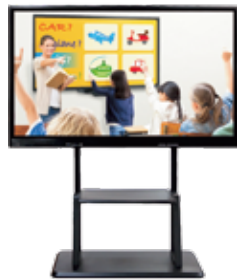
Teach All In One Display