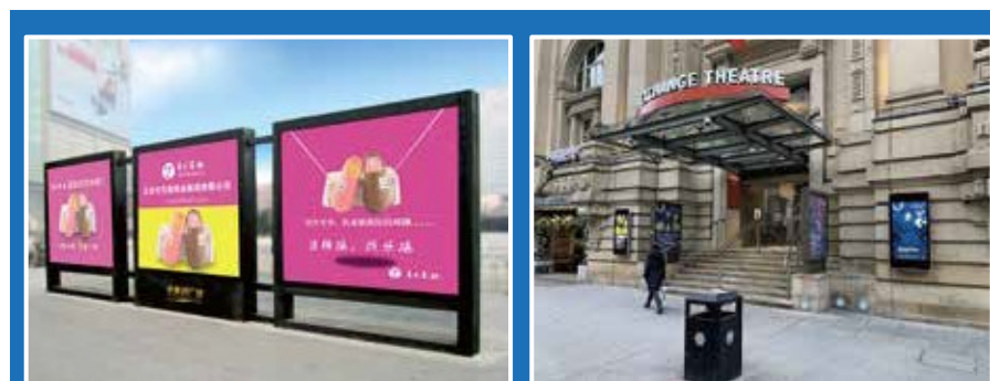
CITY SQUARE / OUTDOOR STREET