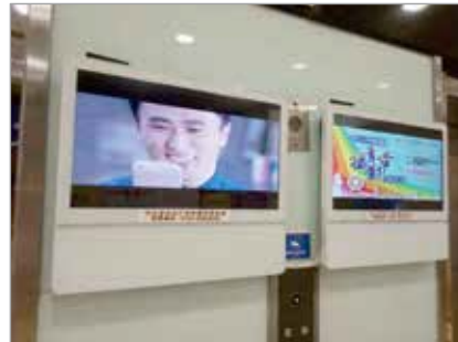
Advertising media company