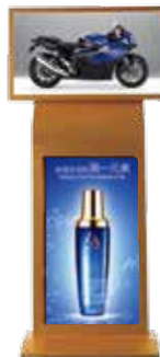
Newspaper And Magazine Holder Advertising Display