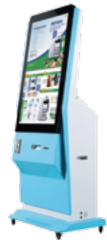
Other Commercial Display