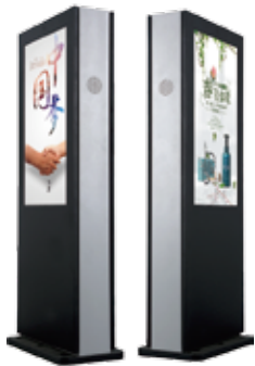
Outdoor Advertising Display