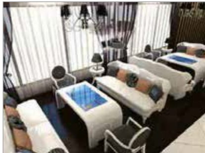
Real Estate Agency