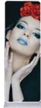
Mirror Intelligent Advertising Display