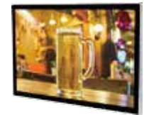
Wall-mounted Advertising Display