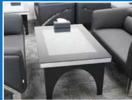
CONFERENCE ROOM / CLASSROOM