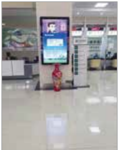
Rural commercial bank