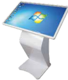
Touch Screen Kiosk